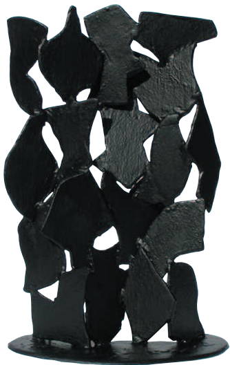
Small Screen Sculpture , 1997. Painted steel. 16.5" × 10.5" × 6"