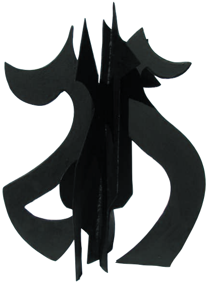
Small Vertical Sculpture , 1995. Painted steel. 28" × 20.5" × 19.5"