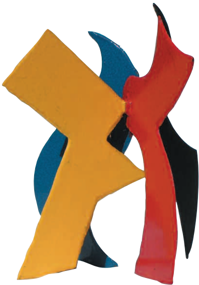
Small Sculpture , 2003. Painted steel. 12.5" × 12" × 12.5"