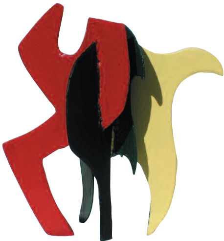
Small Sculpture , 2003. Painted steel. 12.5" × 14.5" × 9.5"