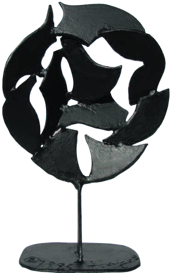
Mounted Screen Sculpture , 1995. Painted steel. 23.5" × 15" × 8"