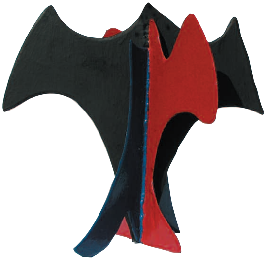
Small Sculpture , 2003. Painted steel. 12.5" × 13.5" × 12"