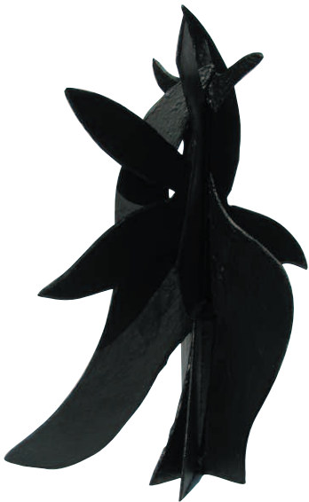
Maquette for Small Sculpture, 2003. Painted steel. 17.5" × 9" × 11.5"