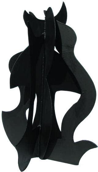
Small Vertical Sculpture , 1995. Painted steel. 29" × 21.5" × 20"