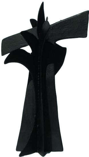
Maquette for Small Sculpture , 2003. Painted steel. 15" × 10" × 8"