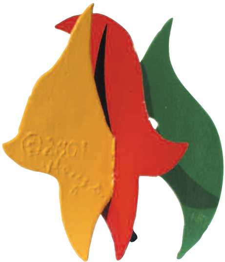
Small Sculpture , 2001. Painted steel. 16" × 14" × 14.5"