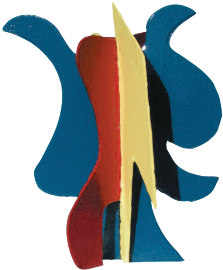
Small Sculpture , 2001. Painted steel. 16.5" × 12.5" × 11"