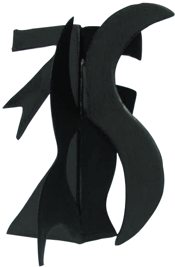
Maquette for Small Sculpture, 2003. Painted steel. 12" × 11" × 8"