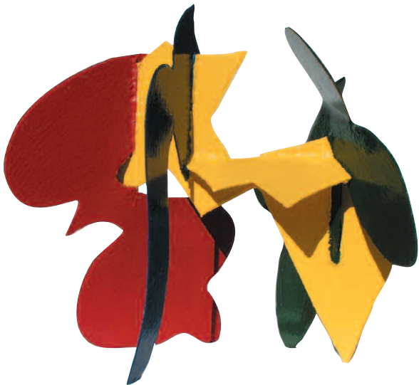
Small Sculpture , 2003. Painted steel. 17" × 18.5" × 12"