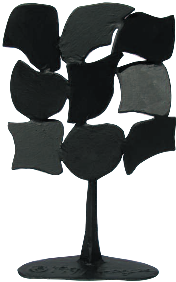
Mounted Screen Sculpture , 1997. Painted steel. 14" × 22.5" × 6"