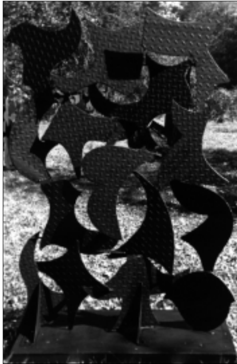
Screen Sculpture #58, painted steel, 1994