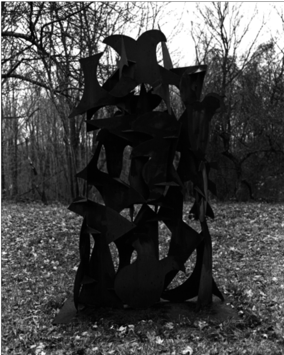
Screen Sculpture #26, painted steel, 1987